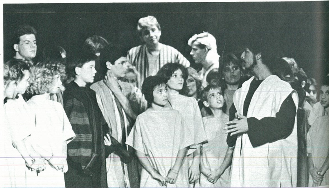
Jesus explains the wages of sin to the children.